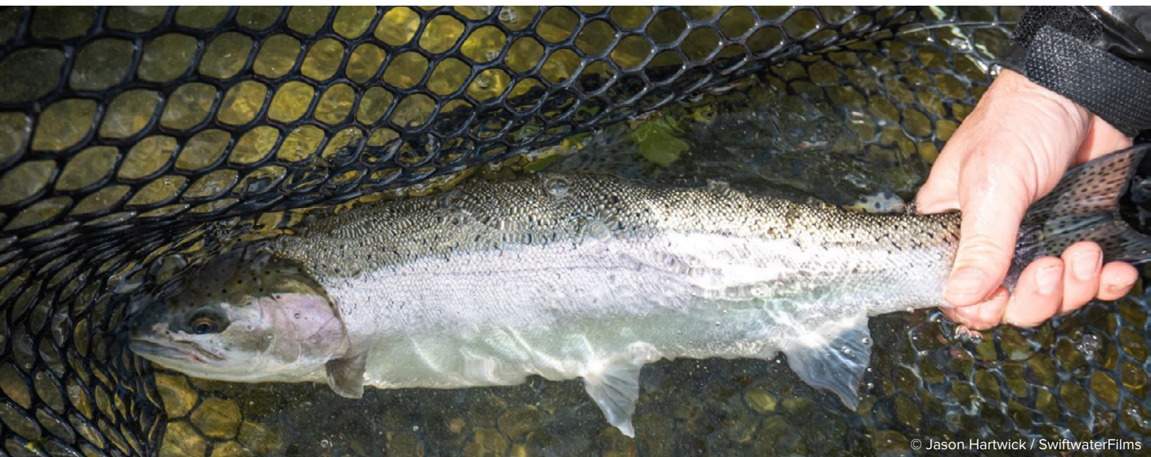
Fly fishing is a popular recreational activity on the Klamath River.