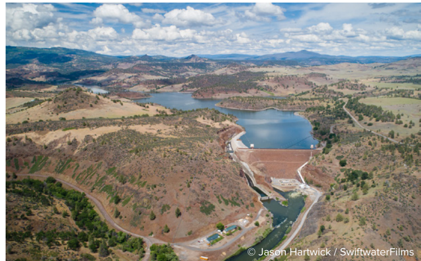
Iron Gate Dam

With no fish ladder on any of the lower three dams, the structures deny salmon access to hundreds of miles of historical spawning and rearing habitat. The reservoirs impounded by the dams allow water to warm to unnatural temperatures, impacting fish health by making them susceptible to disease, and propagating toxic algal blooms that are harmful to people and fish alike. The dams also starve the river of sediment, impacting ecosystems downstream.