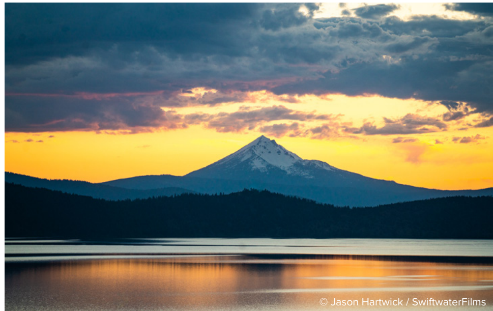
Upper Klamath Lake and Mount McLoughlin.

Karuk, Yurok, Shasta, Klamath and Modoc people have lived alongside the river and subsisted off its fisheries since time immemorial. Salmon remain a critical cultural and subsistence resource to the Indigenous people of the Klamath River to this day. Starting in the mid 1800s, resource extractive industries like timber and mining severely impacted both the landscape and Indigenous peoples of the mid-lower Basin. These industries also brought many other communities to the Klamath River. However, these industries are no longer lucrative, and most people who remain in the mid-lower reaches of the river are employed by schools, Tribes and the Forest Service.