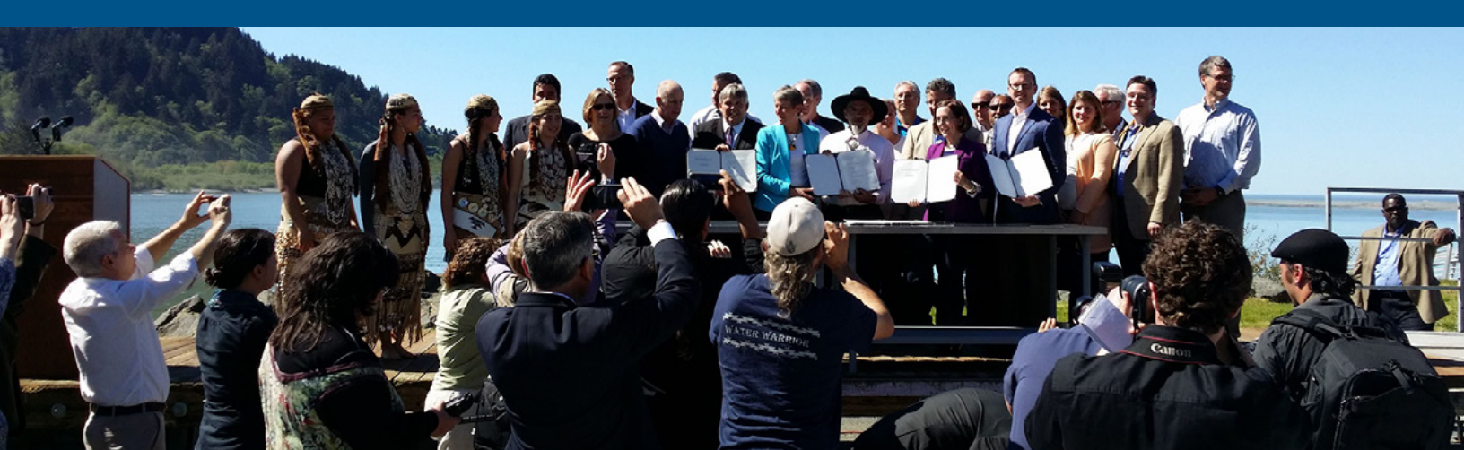
Signatories gather to sign the Amended KHSA in 2016