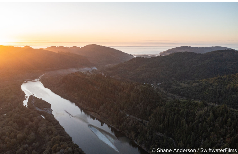
The lower Klamath River right before it meets the Pacific.

The basin is also home to the oldest wildlife refuges in the United States. The Klamath Basin National Wildlife Refuge Complex provides a key stopping point for millions of birds that migrate along the Pacific Flyway each year.