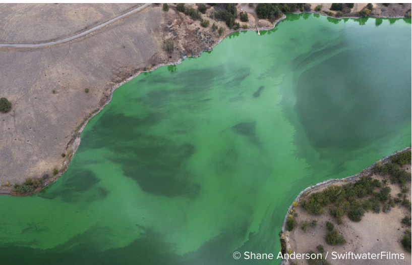
Toxic blue-green algae bloom in Iron Gate in 2021.

The Lower Klamath Hydroelectric Project was built between 1908 and 1962 by the California-Oregon Power Company. With no fish ladder on any of the lower three dams, the structures deny salmon access to hundreds of miles of historical spawning and rearing habitat. The dams disrupt transport of sediment, alter water temperatures, and create the perfect conditions for blooms of toxic blue-green algae.